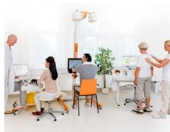
Fig.: Group therapy with TYROSOLUTION in small spaces

was developed for the latter two devices. Together but also individually, the systems provide holistic rehabilitation for the upper extremities for patient groups with various conditions such as spasticity, hypertension, bio-mechanical and musculoskeletal deficits. TYROSOLUTION is also exceptionally well-suited for the treatment of associated problems such as restrictions of postural control, balance and cognition. The team placed great